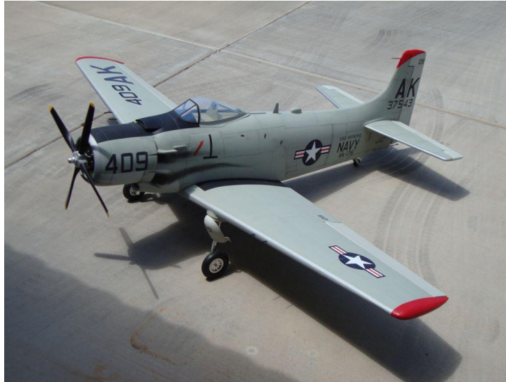
AD-6 Skyraider